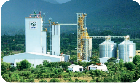
CP FEED FACTORY