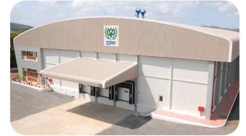
CP PROCEESING FACTORY

Distribution Channels (Food Retailers & Horeca)