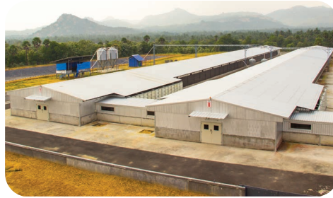
CP BREEDING FARM